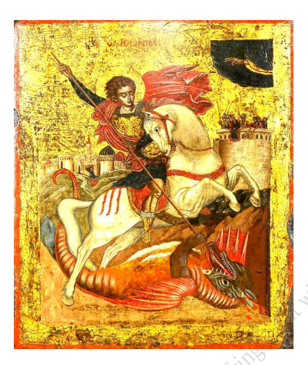
Figure 8: Saint George and the Dragon Greek, Ionian Islands School Mid-17th century Tempera and gold on gesso and wood. The Temple Gallery, London.