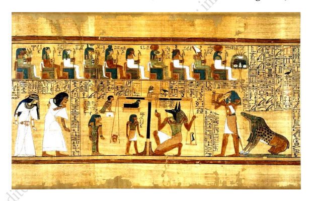
Figure 2: The weighing of the heart ceremony on 'The papyrus of Ani'. The British Museum (Rossiter 1974).

For the Egyptians, the human body ( khat ) was a model of the universe that resembled the macrocosm. The energies in the universe were considered to be similar to those inside the khat . The two sides of the body were considered to have different qualities due to the connection of these body parts with the entrance and departure of the personality soul (the ba ). The ba was thought to enter the body into the right ear at the moment of a baby's birth and to leave the body via the left ear after a person had passed away, allowing it to start its journey through the underworld (Merkel and Joyce 2003). The right part of the human body was, therefore, associated with life force and light, and the left part with death force and darkness. Similar to humans, the gods were believed to have a light side and a dark side. The eyes of the pharaoh-god Horus, for instance, were associated with the sun (right eye) and the moon (left eye) and with the life and death force in nature (Littleton and Fleming 2004).