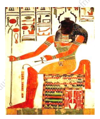
Figure 5: A picture of Khepri, the scarab-headed god, the tomb of Nefertari (Dynasty XIX) in the Valley of the Queens.

universe. They believed that specific energies, such as that of transformation, inhabited several beings. This enabled them to choose from a variety of symbols to represent these energies and to mythically explain the origins of the universe. For them, the analysis of empirical observations of nature was the foundation of the mythical explanations that were believed to sprout from a higher order of consciousness (Hart 1990). The Egyptians believed that the symbolic understanding of the natural energies was more important than the understanding of the empirically observable world. This does not imply, however, that the Egyptians were not capable of thinking logically nor that this preference for a mythological explanation for the existence of the universe was related to the Egyptian concept of mind. Instead, it was the result of a cultural orientation that placed mind over matter and believed that the heart was the centre of the soul.