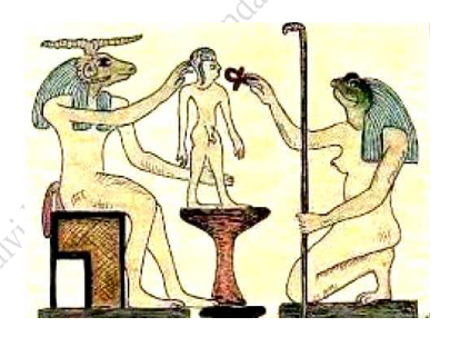
Figure 4: The god Khnum creates the child of queen Ahmes (Ihy) with the assistance of the frog goddess Heket. A relief from the mammisi (birth temple) at Dendera Temple complex, Egypt (south of Abydos).

Another animal, which among the Egyptians also functioned as the head of a god, was the scarab (scarabaeus sacer). Because these beetles use the dung ball that they are rolling for themselves as a brood chamber for their eggs, it symbolised the reincarnation of the dead and the rising of the sun. Equal to the sun the scarab beetles rolled their ball from East to West and equal to Ra the young scarab beetles appeared to be capable of spontaneous creation as they emerged from their burrow(Van den Berk 2015). Twinge scarabs also characterised the human brain, which was similar in shape. The Egyptians associated the scarab and the brain with creative (sexual) force and spontaneous resurrection. Since the Middle Kingdom, the scarabs were placed on the heart of mummies to protect this alleged central organ during the body's entry in the afterlife. The bottom of the scarab contained an inscription from 'the Book of the Dead'. The inscription was meant to protect the deceased against confessing to any of the wrongs that (s)he might have committed during his or her lifetime once (s)he was brought before Osiris and the tribunal of the gods (the weighing of the heart ceremony)(Wilkinson 2008).