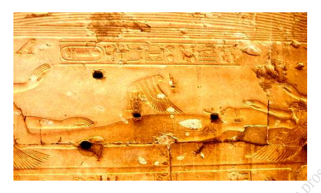
Figure 1: The procreation of Horus, son of Isis, Abydos Temple relief Sethos, Egypt.