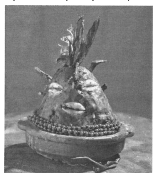
Fig. 3. The West African legba divinatory shrine

Contemporary machinic assemblages have even less standard univocal referent than the subjectivity of archaic societies.<sup>1129</sup>